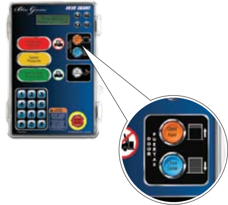
Blue Genius™ – combo with door buttons shown.