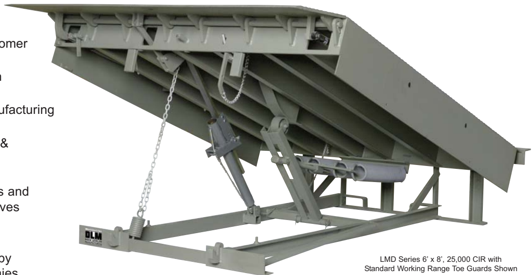
LMD Series 6' x 8', 25,000 CIR with Standard Working Range Toe Guards Shown