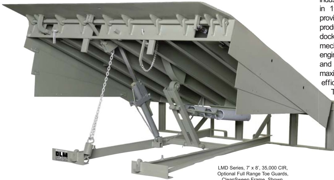
LMD Series, 7' x 8', 35,000 CIR, Optional Full Range Toe Guards, CleanSweep Frame Shown.

Since introducing the freight industry's first Edge-of-Dock leveler in 1962, DLM has continued to provide innovative ways to improve productivity and safety at the loading dock. The DLM "LMD" Series mechanical leveler is value engineered to meet both application and budget constraints while maximizing productivity, optimizing efficiency and improving safety. The DLM "LMD" Series leveler is a cost effective solution engineered to include the manufacturing efficiency of the "Lug Hinge" deck design. Common sizes and capacities are available.