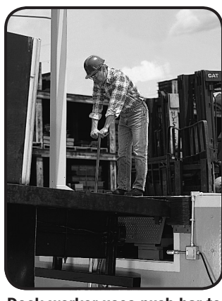
Dock worker uses push bar to activate and release