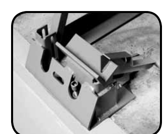
Front SafeTFrame™ Pedestal