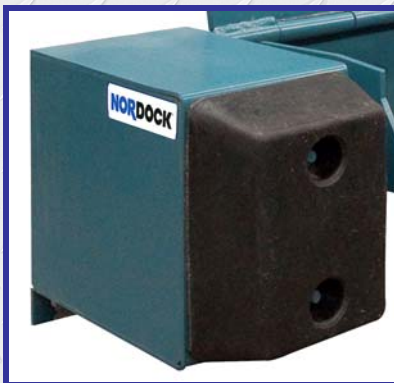
CLOSED BUMPER BLOCKS