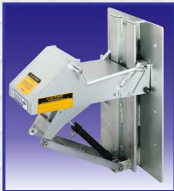
AVAILABLE TRUCK-LOCK® SAFETY SYSTEMS