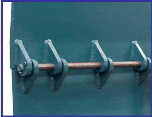
SELF-CLEANING LIP LUG DESIGN