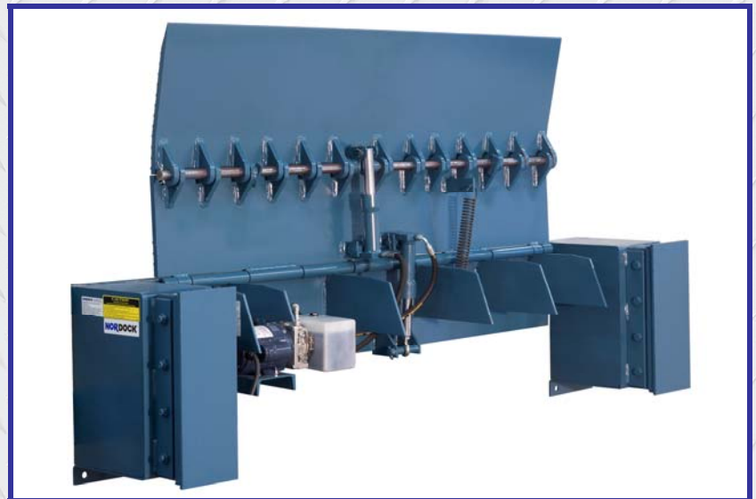
MODEL EFH 60,000 POUND CAPACITY SHOWN WITH OPTIONAL STEEL FACE VERTICAL DOCK BUMPERS