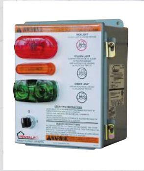
Pentalift Model LPR35 Vehicle Restraint Safety System Maximize safety and efficiency at the loading dock