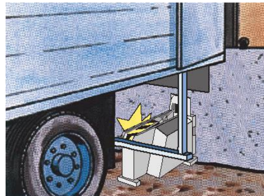
Competitors higher designs result in impacts

In order for the trailer to back into the loading dock the rear impact guard of the trailer must pass over the top of the vehicle restraint. Once this has taken place the vehicle restraint is then activated to engage the rear impact guard of the trailer. Trailer manufacturers are producing trailers with lower and lower rear impact guards. If the restraint is too high to allow the rear impact guard to pass over the top of it, two significant problems occur: 1) The trailer is unable to back up to the loading dock and cannot be loaded or unloaded. 2) The restraint is unable to engage the truck. The extremely low lowered height of the Pentalift model LPR35 restraint addresses this concern. It is significantly lower than other manufacturers restraints. It addresses concerns related to the continuing trend for lower and lower rear impact guards being supplied on trailers for today and for the future.