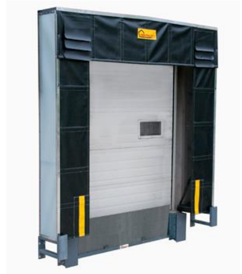
PS-400 Dock Shelter