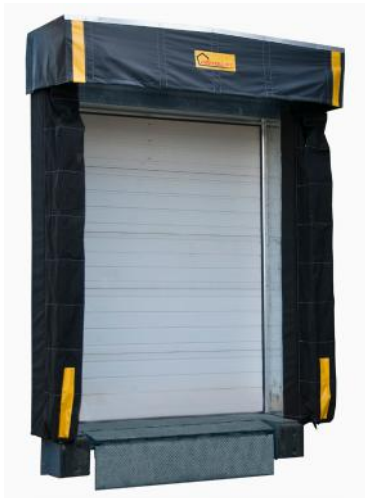
PSI-350 Inflatable Dock Seal