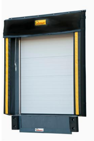
PS-200 Dock Seal