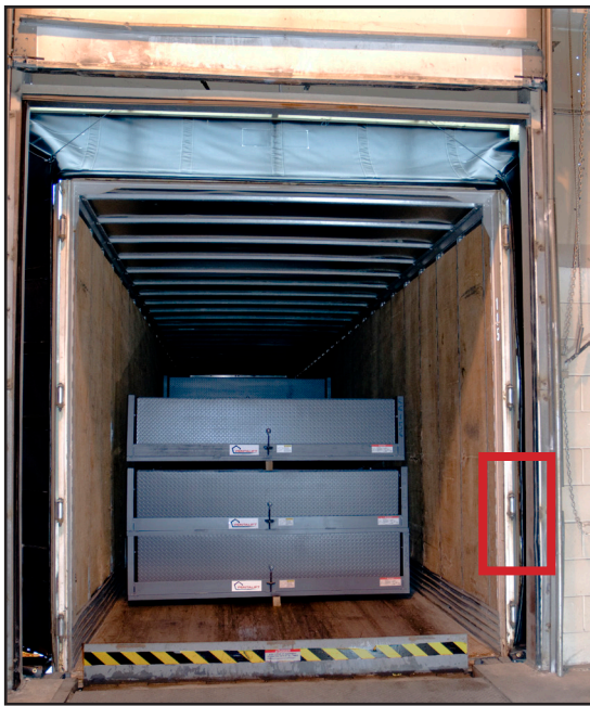
Full Access to Trailer Door Opening