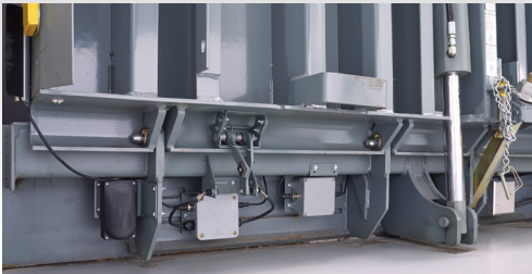
Safe-T-Pit™ (patent pending)