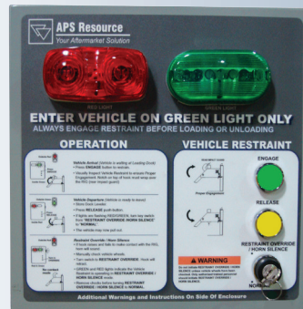
Compact 12"x12" Size Heavy Duty Industrial Control Box