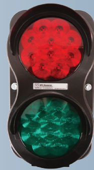
Universal Red and Green LED Lights