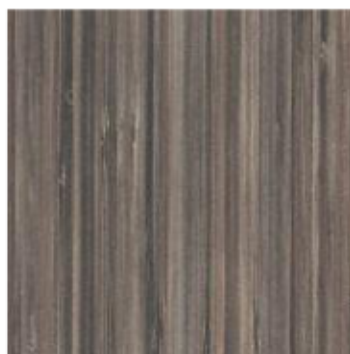
Smoked Sugar Cane*