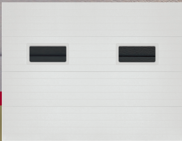
9' x 7' 3236 white with optional 24" x 12" windows and tinted glass